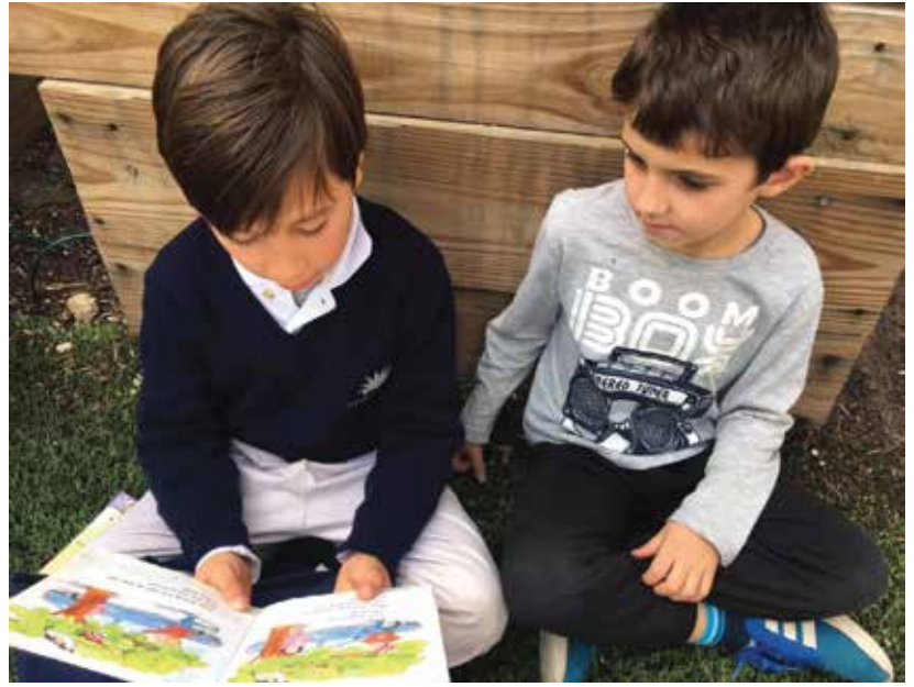
Our Grade 1s sharing their love of reading with the Grade Rs